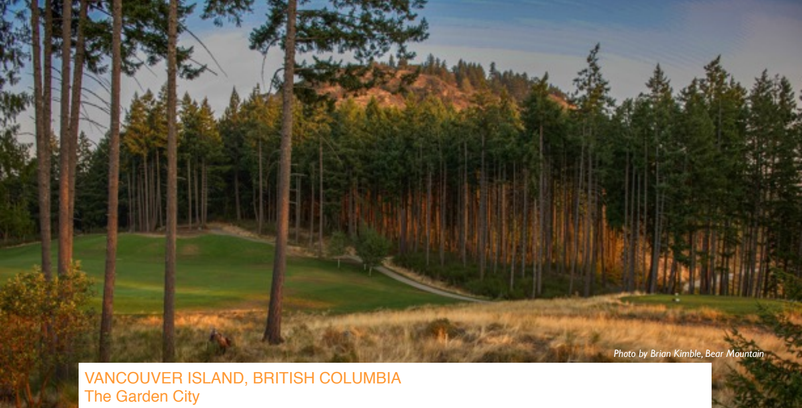
Bear Mountain