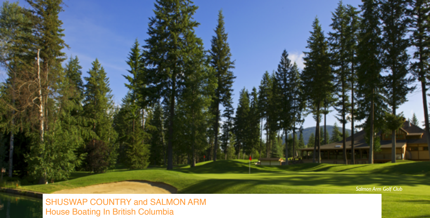
Salmon Arm Golf Club