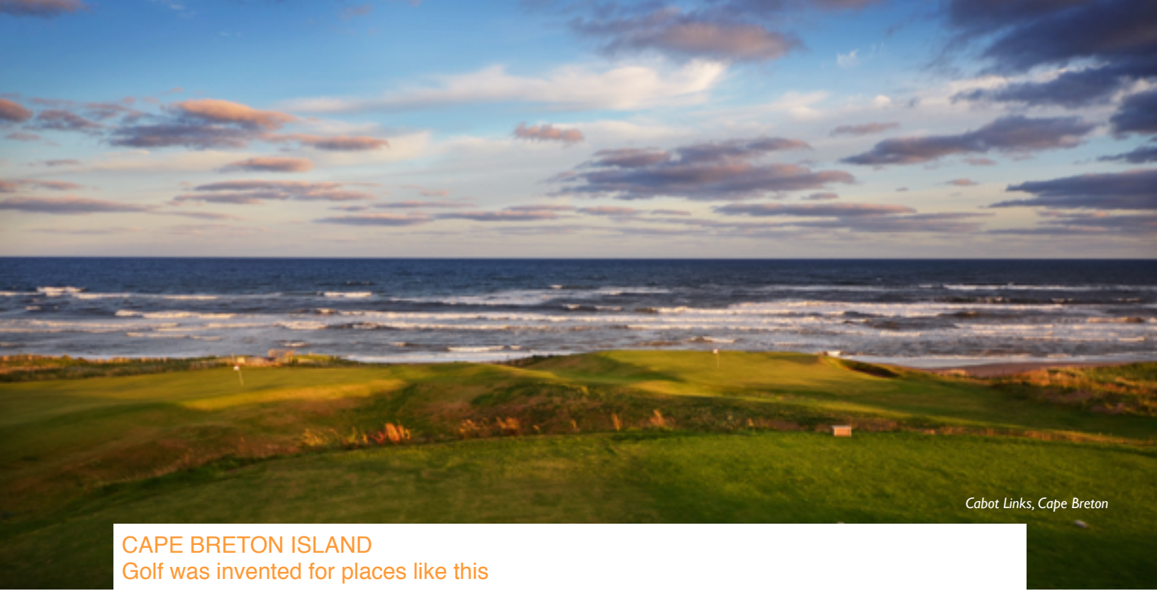
Cabot Links, Cape Breton