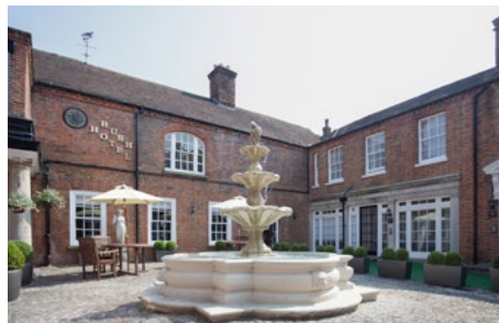
Mercure Farnham Bush