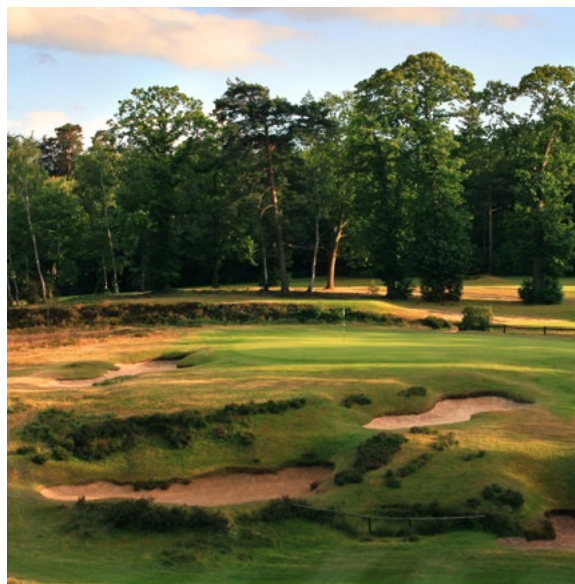
St George's Hill