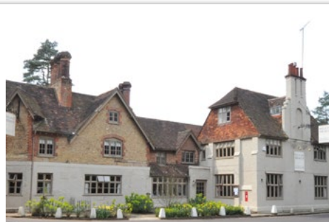
Bel & Dragon, Churt

We have a number of Accommodation Partners in the Surrey & Berkshire region, in close proximity to all of the golf courses in this cluster.