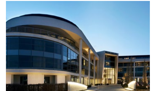
Brooklands Hotel, Weybridge