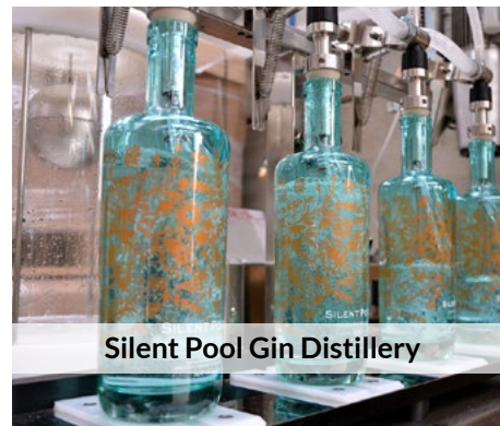
Silent Pool Gin Distillery