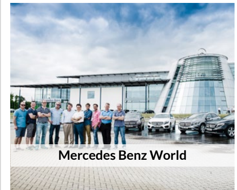
Mercedes Benz World