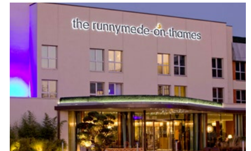
The Runnymede-on-Thames, Egham