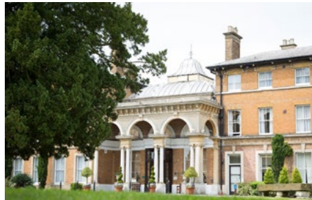
Oatlands Park Hotel, Weybridge